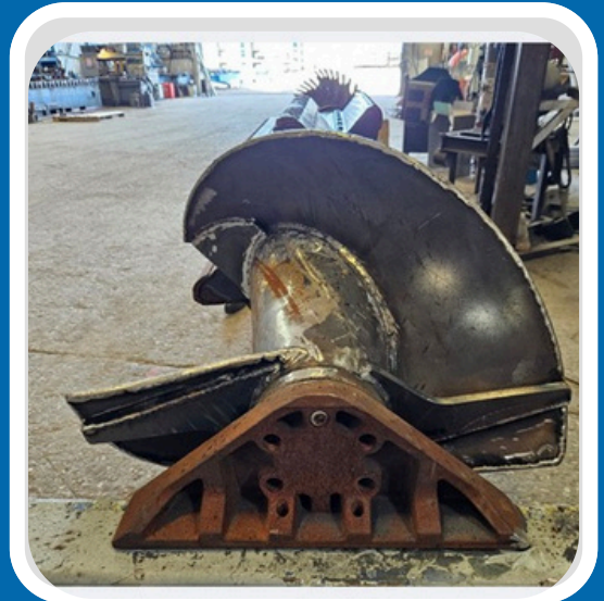
OEM Four Flat Flights