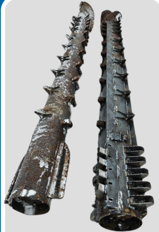
← OEM Old Style Upgraded Flax Rotor →