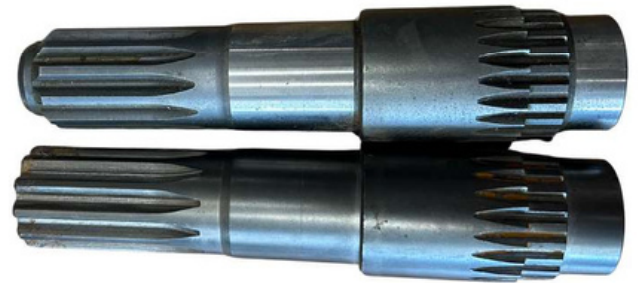
Improved extended design

Longer shaft to catch virgin splines, can be installed when original is stripped out to get you going right away again